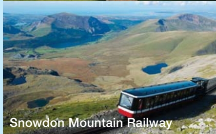
Snowdon Mountain Railway